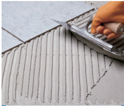
Installation of single-fired tile on expanded foam concrete block walls