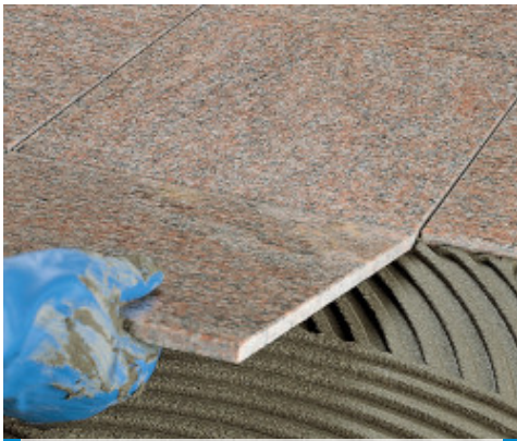
Installation of pre-glossed marble on floors