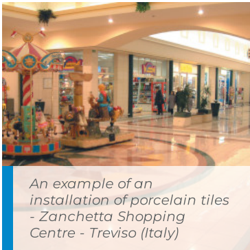
An example of an installation of porcelain tiles - Zanchetta Shopping Centre - Treviso (Italy)