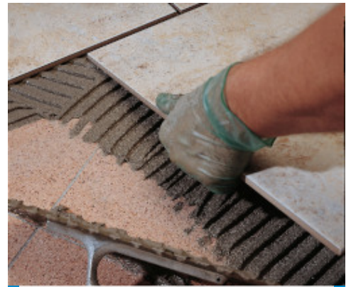
Single-fired tile on terrazzo tile of an external wall